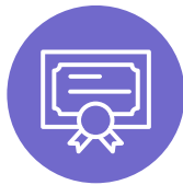
High School Diploma & Transcript