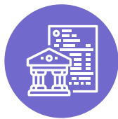
Bank Statement 3 Months Report