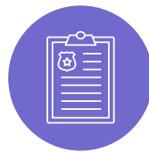
Police Clearance Report