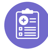
Medical Examination Report