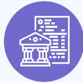
Bank Statement 3 Months Report