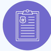
Police Clearance Report