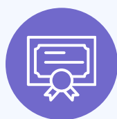
High School Diploma & Transcript