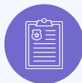
Police Clearance Report