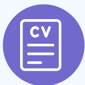
Detailed CV (EUROPASS FORMAT)